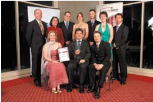
Neighbourhood Cable